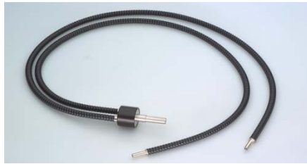
Flexible light guide 2 branch