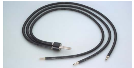
Flexible light guide 3 branch